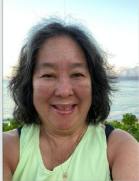
BETSY CALLANAN SOCIAL MEDIA/NEWSLETTER